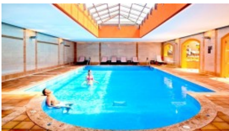
Indoor heated pool